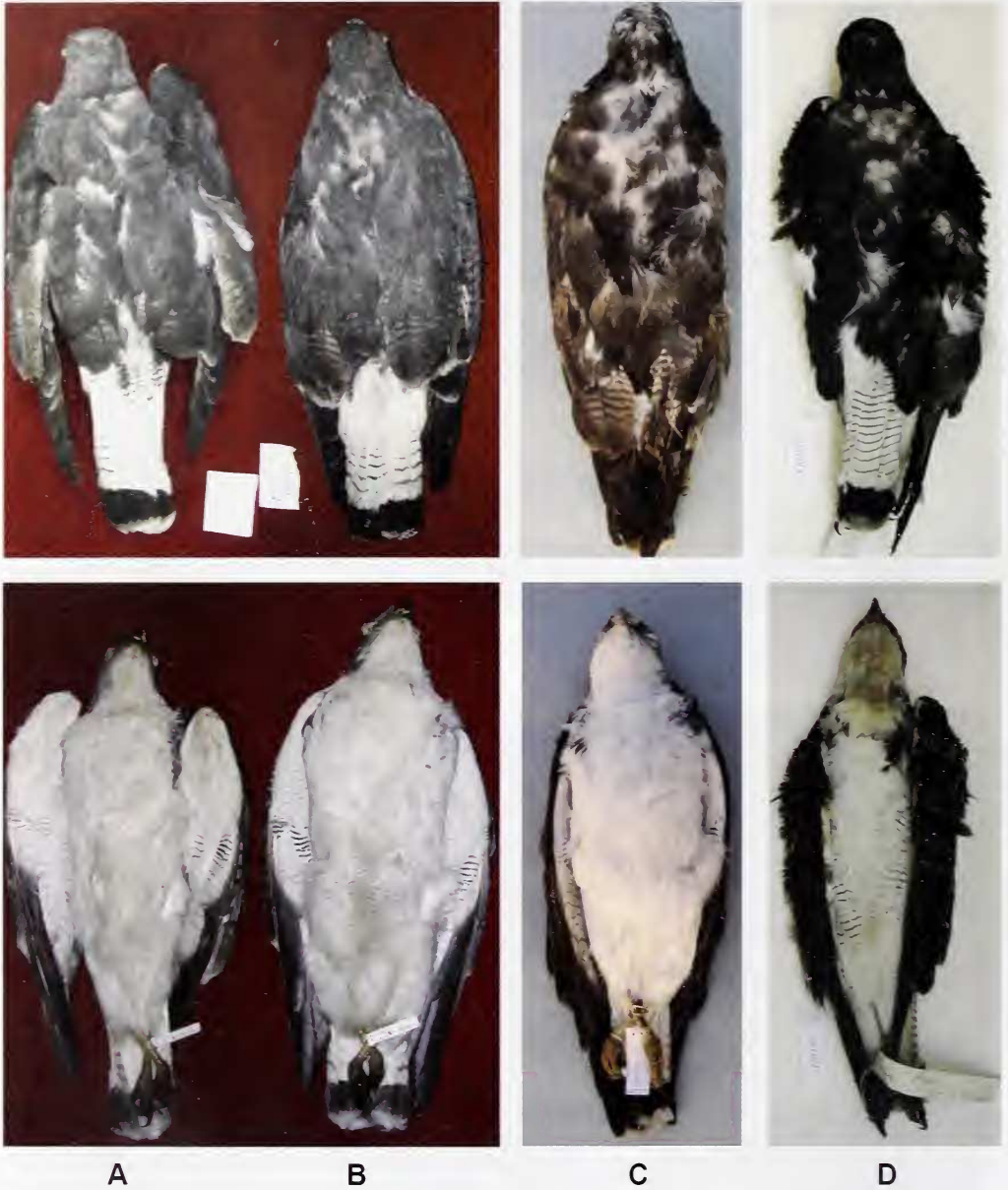
Figure 6. Pale-morph adult male Gurney's Hawks Buteo poecilochrous : (a and b) nominate subspecies from Ecuador (Museo de Ciencias Naturales del Instituto 'Mejía', Quito); (c and d) subspecies fjeldsai from Bolivia (EBD) and southern Peru (NMNH) (J. Cabot)